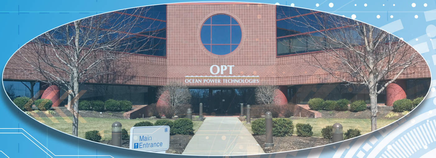
Future OPT Headquarters